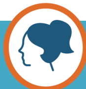
HAIR TIED BACK